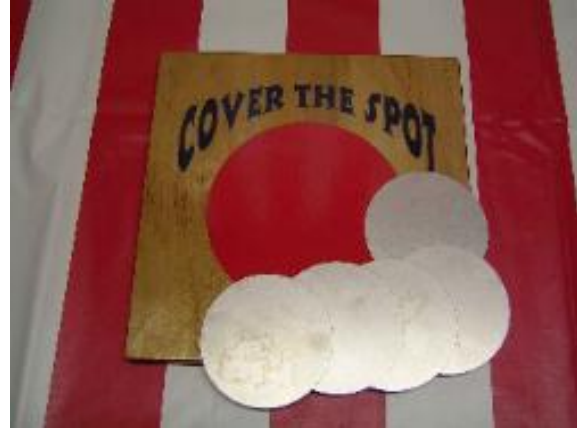
Cover The Spot