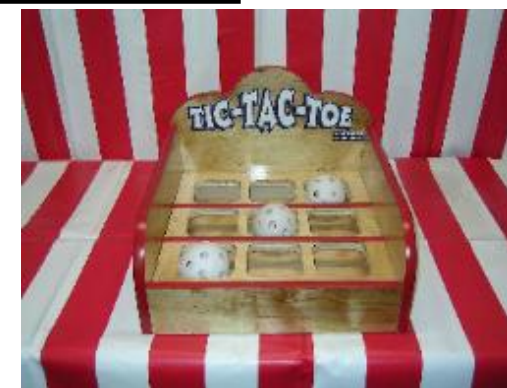
Tic Tac Toss