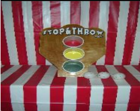
Stop N Throw