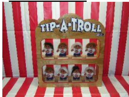
Tip A Troll