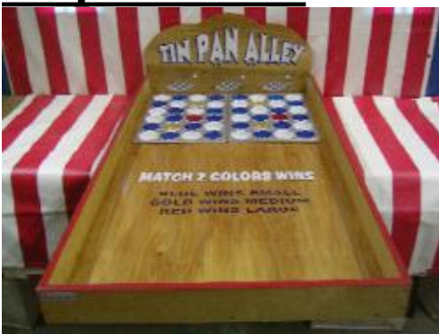
Tin Pan Alley