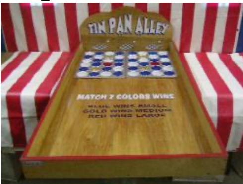
Tin Pan Alley