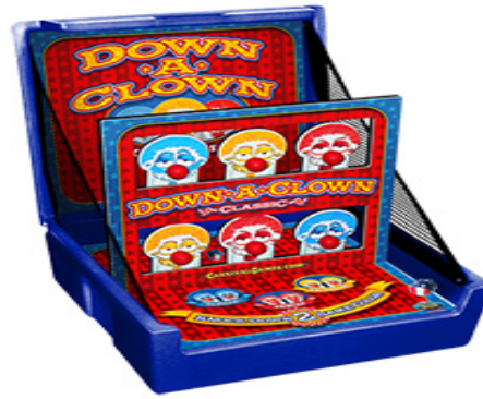
Down A Clown