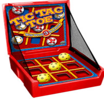
Tic Tac Toss