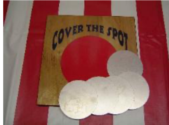
Cover The Spot