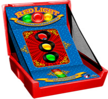
Stop N Throw